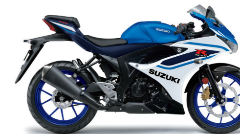
Metallic Triton Blue / Pearl Brilliant White (BQJ)