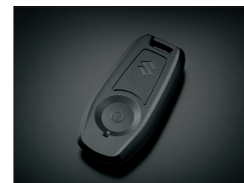
Key-Less Ignition System