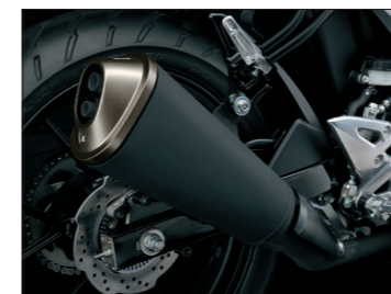
Dual-Exit Exhaust Muffler