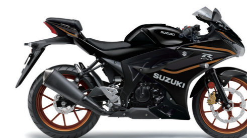
Titan Black (YVU)