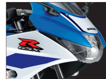
LED headlights and LED position lights